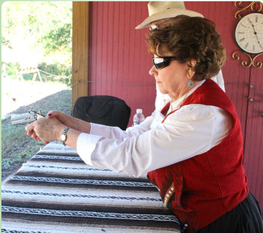
Texas Flower (SASS #43753) blazing away at the derringer side match.