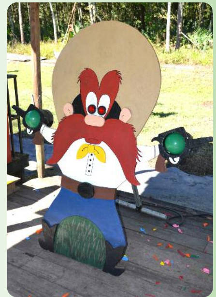
Quick draw shooting with Yosemite Sam.